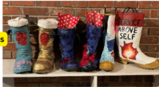
Boots for Heroes

Welcome Welcome Welcome to all who come to the Roswell Rotary meeting this Thursday for lunch. We will not only be hosting 13 of our 16 Interact Clubs but also the City of Roswell Youth Ambassadors for the Youth Day Parade on Saturday, Oct 3rd. This meeting is always inspiring and gives us the very face of hope on our stage.