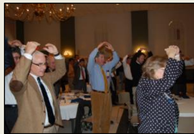
And EVERYONE Got Into the Singing